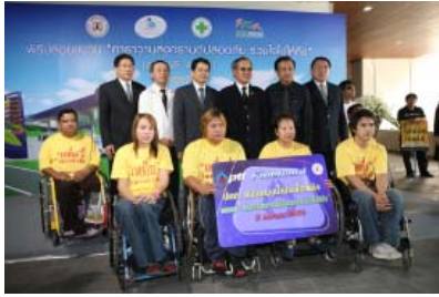
Safe Songkran Caravan