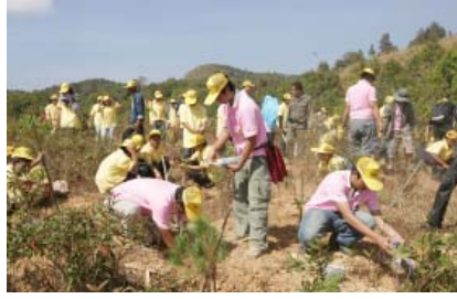
Mangrove Forest Conservation