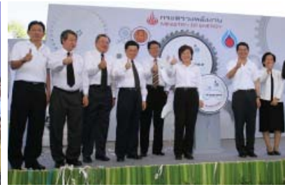
PTT Engine Tune-Up

Office and PTT offices in various areas for allocation to police stations and related units, both in Bangkok and the provinces. Moreover, the Company granted support to ‘Don’t Drive Drunk’ Foundation as well as many other public and private units in the organization of “ Safe Songkran-Arrive Alive Caravan ” to 27 provinces around the country, and ‘ Wheelchair for Safe New Year- Arrive Alive Caravan ’ organized by those people made disabled by drunk driving, in which ‘wheelchair people formed a caravan’ from PTT Head Office to Laos Government House in Vientiane, Laos PDR. PTT contributed fuels and facilitated the caravan throughout the route by providing rest areas and toilets at PTT stations along the route.