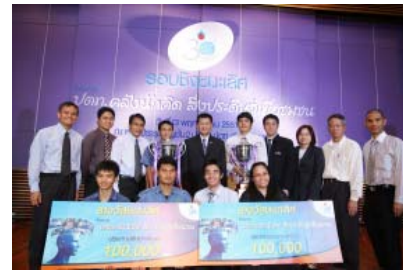
2 nd Innovation Contest

Phrong, Tambon Khao Hin Chai, Chachoengsao. Moreover, 830 scholarships were allocated for 13 consecutive years for students ranging from primary to university level in educational institutes located around PTT branch offices across the country and along the natural gas transmission pipeline.