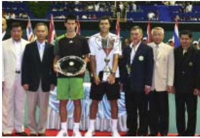
ATP Thailand Open 2008