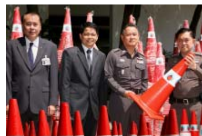
The launch of Traffic Relief Program