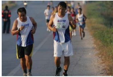
PTT Group Mini-Half Marathon