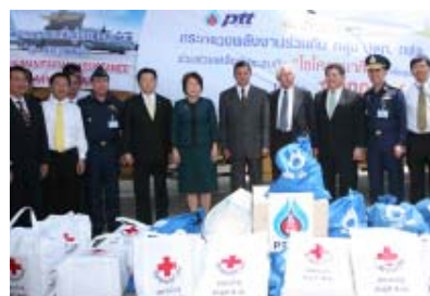
Relief Bags for Nargis Victims