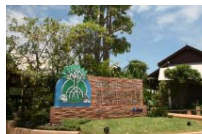
Sirinrat Rajini Learning Center