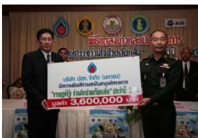
Urgent Reliefs to Alleviate Natural Disasters