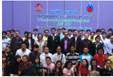
Drive Safely Program