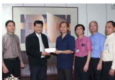
Support to CEI