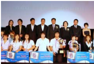
PTT Idea Maker Award