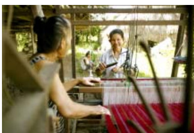
PTT Village Development