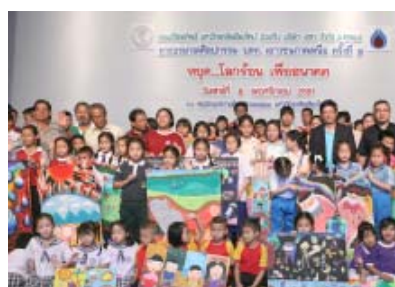
PTT Art Contest for Youths