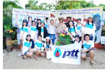
Return Beautiful Sea at Chang Island