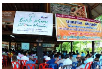
84 Tambons on a Sufficient Path