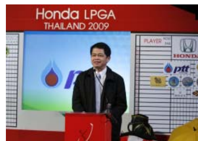
LPGA Thailand 2009