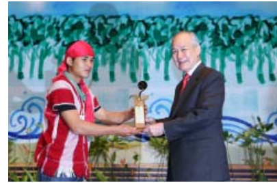
One Decade of Green Globe Award

eight campuses of Rajabhat University and expanded the learning center from 81 branches in 23 provinces to 117 in 30 provinces. The project produced more interdisciplinary graduates for rural development while adding programs involving science and technology for community at the bachelor's degree level as well as community health programs at both bachelor's and master's degree levels. This support to "Learning Institute for Everyone" will be established in Samut Songkhram Province in 2009. Moreover, the foundation, in an attempt to reduce people's debt burden in accordance with the sufficiency economy philosophy, joined the Bank for Agriculture and Agricultural Cooperatives and Local Administration in providing training for agriculturalists, BAAC debtors, and representatives of local administrations to equip them with proper understanding of the philosophy so that they may map out their own community development strategies.