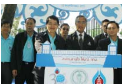
Present Pedestrian Bridge to BMA