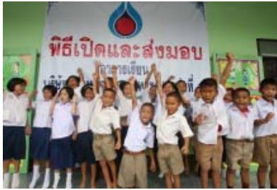
School Building Presentalian